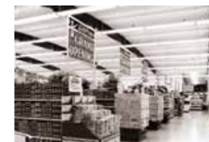
Grand opening in-store signage