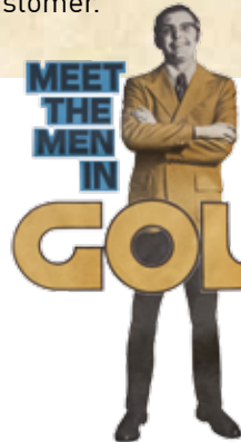
The "Man in Gold" 1973