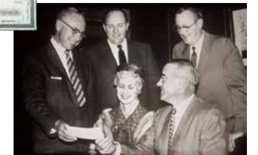
Going public 1969