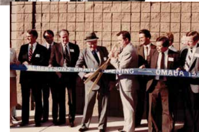
Ribbon cutting ceremony in Omaha 1981