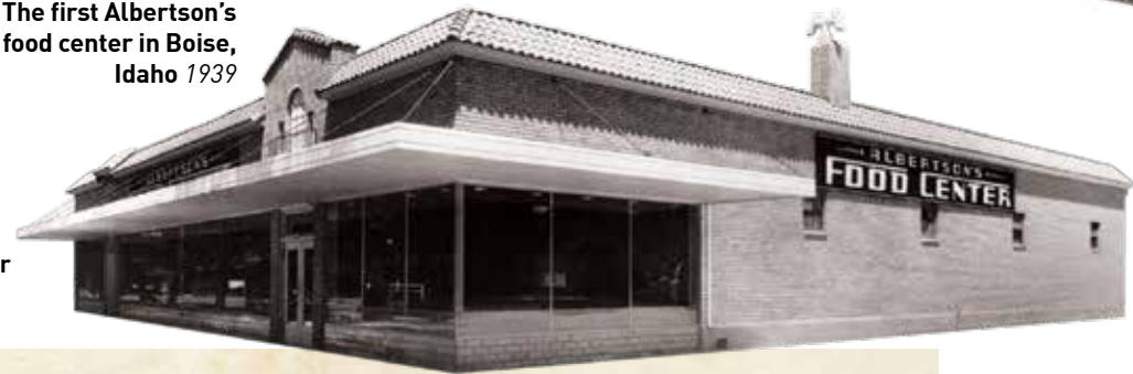
The first Albertson's food center in Boise, Idaho 1939