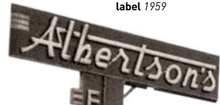
Albertson's Food store signage 1950s