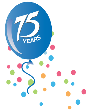
75th Anniversary 2014